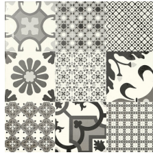
LOGOS NEGRO 10,0000 22,8"X22,8"