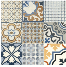
LOGOS AZUL 10,0000 22,8"X22,8"